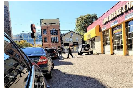
The Average Busy Day in the life of Midas Clybourn Team-Members!