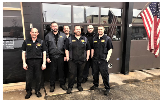
Midas Dodge Street – That is One Good-Looking Shop, and Crew!