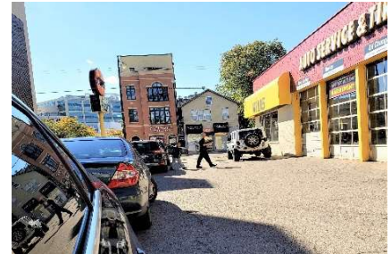
The Average Busy Day in the life of Midas Clybourn Team-Members!