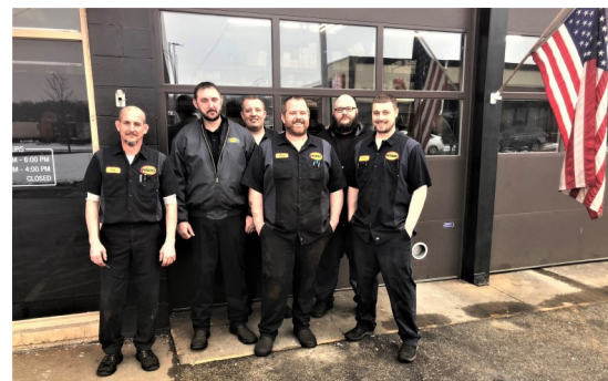
Midas Dodge Street – That is One Good-Looking Shop, and Crew!